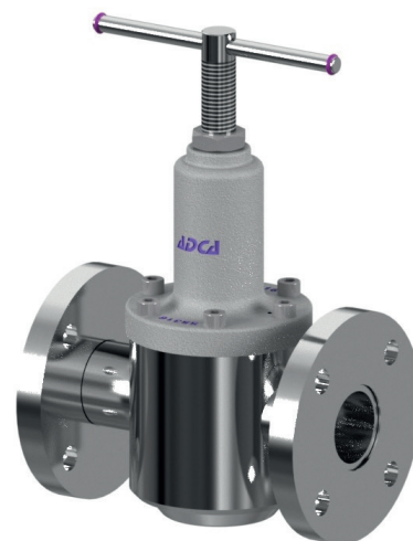
Type 01 A flanges