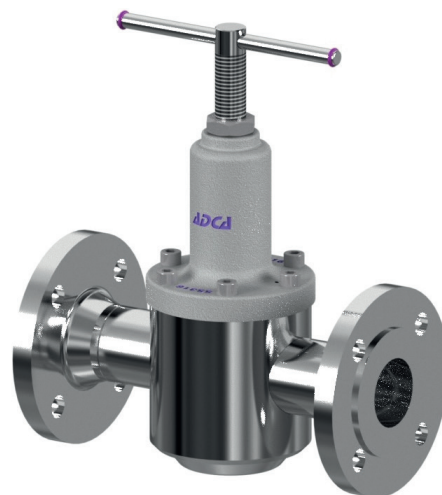
Type 11 B flanges

INSTALLATION: Horizontal installation. A "Y" strainer should be installed upstream of the valve. See IMI – Installation and maintenance instructions.